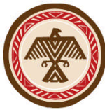
TABLE MOUNTAIN GRILL & CANTINA

Buffet Style Dining accommodating parties of ten to twenty people in the Del Rio Room